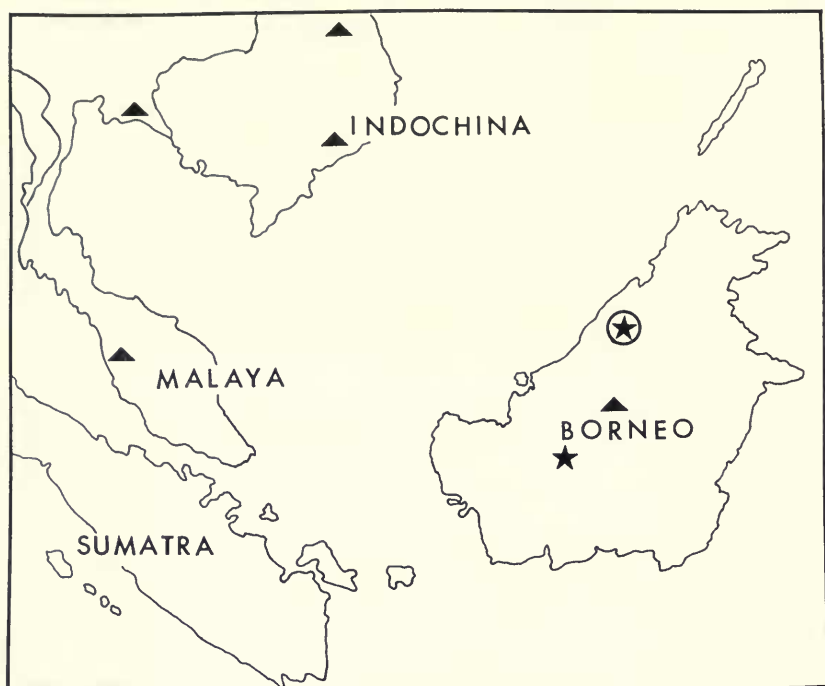
FIG. 4. Triangles show localities of Sphenomorphus stellatus ; stars show localities of Sphenomorphus hallieri ; circle shows type locality of Sphenomorphus maculicollis .

between parietal and the level of the posterior surfaces of the thigh; 2 scales which precede the vent are slightly larger than adjoining scales.